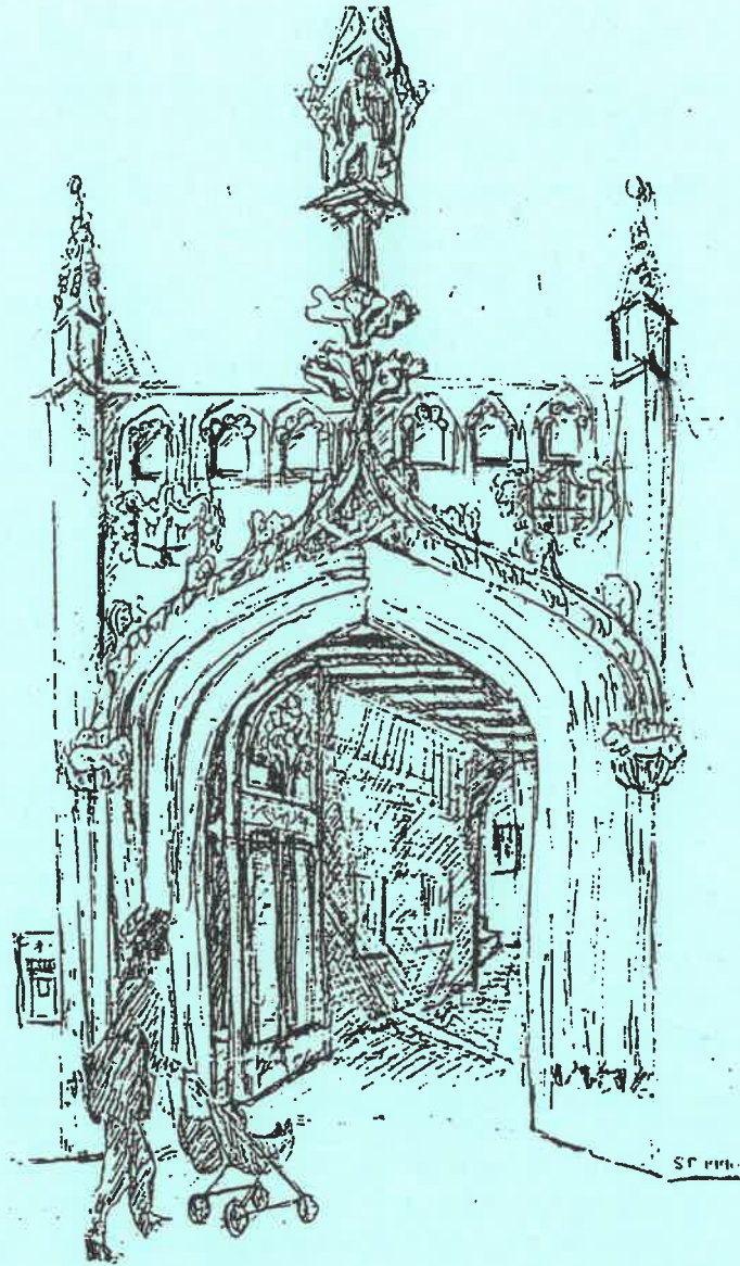
Line drawings by Shirley Prendergast